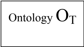
Fig. 2. Ontology O_T . Properties are of the form [property-name = value], where the property name or the value may be concepts as in [eats = tropical_plant, citrus] or tokens of the types of footnote 10, as in [color = orange].

thing (thing, something, object, entity) { physical_object (concrete object, physical object) { living_creature (creature, life form, live being, living creature, organism, being){ animal (animal) { invertebrate (invertebrate) { insect (insect, bug) { fly_animal(fly, flies) cockroach (cockroach) flea(flea) } mollusk (mollusk) } vertebrate (vertebrate) { reptile (reptile) { lizard (lizard) iguana (iguana) } batrachians (batrachians) { frog (frog) } mammal (mammal) { zebra (zebra) rodent (rodent) { rat (mouse, mice, rat) { domestic_rat (domestic rat) country_rat (country rat) } mole-rodent (mole) } fox (fox) cat(cat, kitty) dog(dog) lion(lion, cub) donkey(donkey) man (man, men, woman, women, person, people, human being, Homo Sapiens, boy, girl, child, miss, mister, sir) [eats = tropical_plant, citrus] } bird (bird) { chicken (chicken, hen, cock, rooster, chick, poultry) duck (duck) parrot (parrot) hawk (hawk) } fish (fish) } } plant-creature (plant, vegetal) { tropical_fruit (tropical fruit) { coconut (coconut) mango (mango, mangoes) } citrus (citrus, citric) { lemon (lemon) orange (orange) tangerine (tangerine) [color = orange] rare_fruit [color = green] [texture = smooth] [size = 5cm] } } bacteria (bacteria, microorganism) } artificial_object (artifact, artificial object) } abstract_object (imaginary object, abstract thing, abstract concept) } } } }